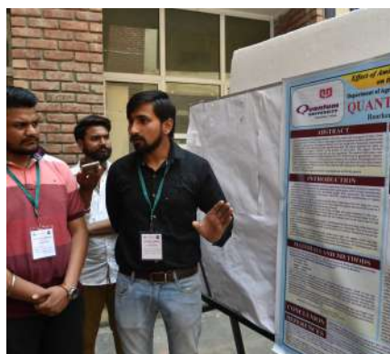
Students from Quantum University can be seen explaining their poster to the judges in Poster Making event during the seminar. Students from several colleges participated.