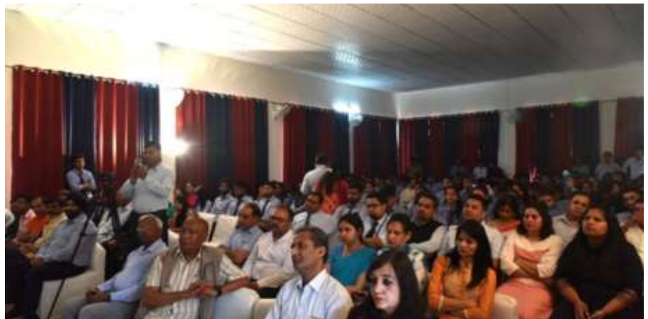
The guests, faculties and students all were in attendance during the one day literature festival that was held at the campus. It was thoroughly enlightening for the audience, as it is not everyday that you get to listen to the stalwarts of literature under one roof in one day...