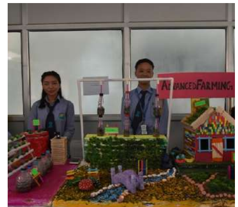
Students from Agriculture and Forestry department of Himgiri Zee University along with students of other Universities displayed their models to the panel of judges.