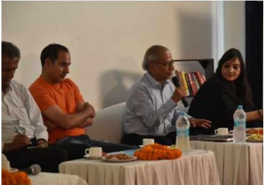
The hills and mountains hold special inspiration for the literati and thus they discussed how it has influenced them over the ages...