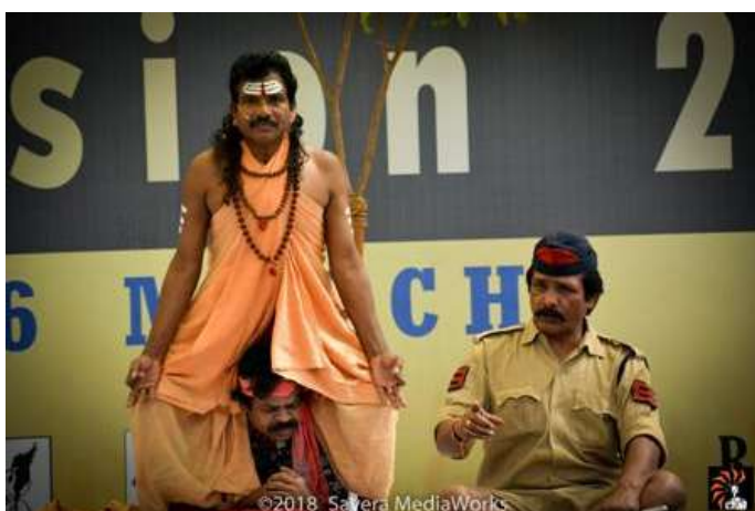
As the day progressed other events were held for the students on day one of the programme.