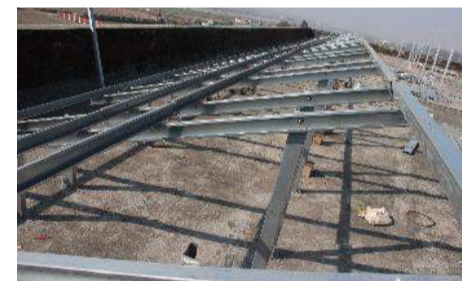
Solar panel being installed on FBII

In their bid to create a better environment for the future generations the