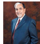
PATRON: DR. SUBASH CHANDRA, Chairman, Zee and Essel Group