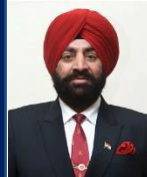
VISITOR: LT. GEN. GURMIT SINGH, Governor of Uttarakhand